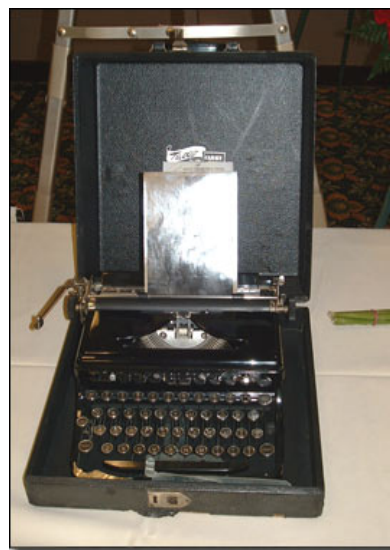
Gary Webb's first typewriter

Carmichael, California; Saturday December 18, 2004, (FTW) - The world has said its powerful, enduring and loving goodbye to Gary Webb.